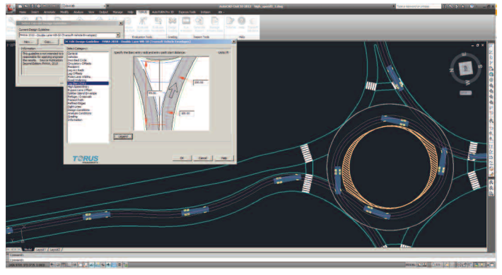
>> Set design vehicles to draw outer edges on entry and exit side of legs.

Customize the roundabout design with vehicle swept paths. Designers can apply this to define the geometry of custom truck aprons, outer aprons, extended central islands, and outer roadway edges. Now each roundabout can be designed uniquely to meet site constraints and vehicle requirements on any number of roundabout projects.